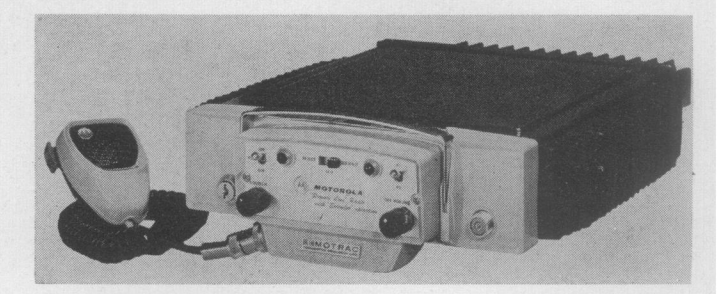
Fig. 5—The 1961 mobile FM station with transistorized receiver and power supply.

The change from AM to FM did not alter the physical characteristics of mobile equipment significantly. The transmitter was still a combination of frequency multipliers and a power amplifier, with the phase modulator substituted for the amplitude modulator. The receiver became a double-conversion superheterodyne with RF and IF amplification, but with the addition of limiters and a frequency detector which differentiated it from the AM unit. The first major construction change came with the adoption of the single-chassis construction for both transmitter and receiver, as opposed to the earlier approach where the transmitters and receivers were separate units. The single chassis reduced the size of the equipment, but perhaps the real advantage was the reduction in manufacturing costs.