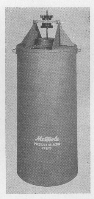
Fig. 4—Quarter-wave cavity selector used for base station control of intermodulation and desensitizing in the 160-Mc band.