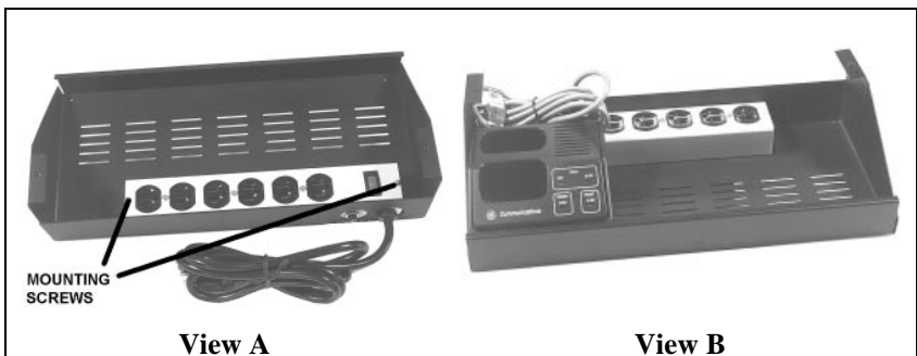
Figure 1 - Assembly of 3-Unit Charger