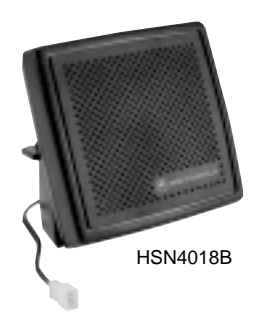
External Speaker Provides Audio for High Ambient Noise Environments HSN4018B External Speaker