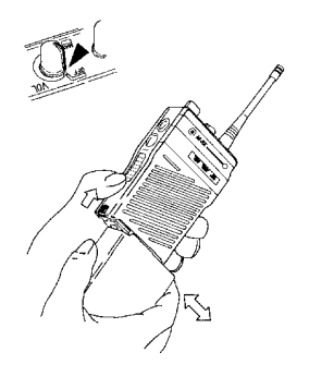
Figure 1 - Installing and Removing the Battery Pack

To remove the battery pack, push up on the battery latch and slide the battery pack to the right. To replace the battery, align the battery on the track and slide to the left until a click is heard, indicating the battery is correctly installed.