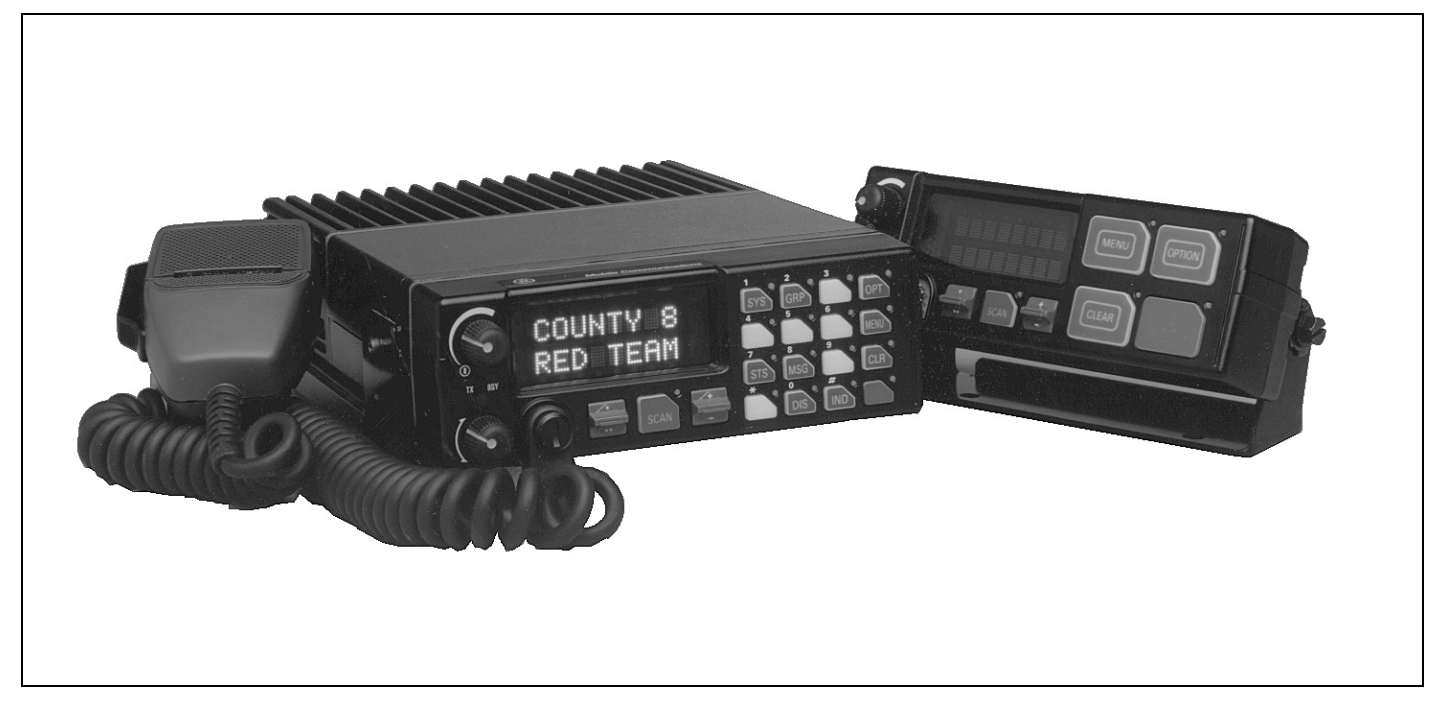
Figure 1 - ORION Mobile Radio